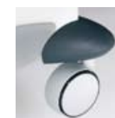
Castor with brake

Zimmer MedizinSystems Corp. 25 Mauchly, Suite 300 Irvine, CA 92618 Phone (800) 327-3576 Fax (949) 727-2154 info@zimmerusa.com www.zimmerusa.com